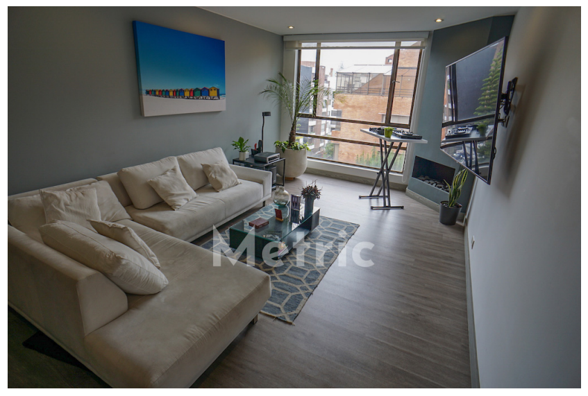
Code: 2321 Apartment for sale at 14 with 100